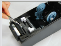
Reflective sensor (Black Mark Sensor)