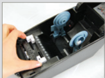
Transmissive sensor (Gap, Media sensor)