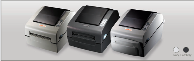
SLP-D420 (Standard Type)