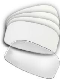
11-0318: Replacement Window 5 pack Allows the user to replace a damaged window without sending the scanner in for repairs.