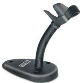
STD-QD20-BK: Hands-free Stand Allows use of the reader in hands-free mode. Also available in white.